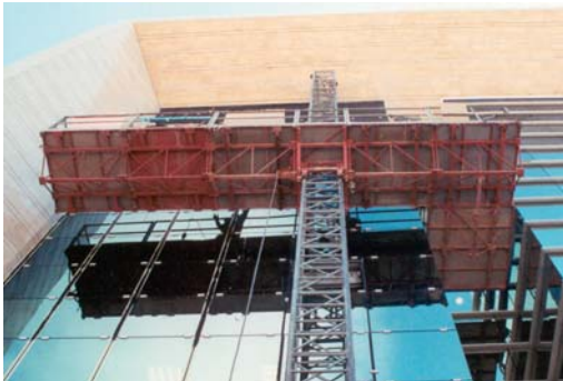
Extensions up to 3,7 m